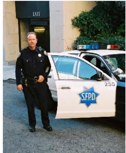
SF Police Officer three years after LASIK at PVI