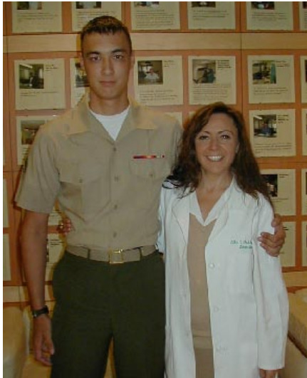
U.S. Marine one month after LASIK at PVI